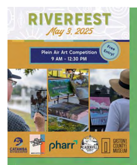
Exhibit to open April 25 – August 23 Prospectus and specifications may be found on our Guild website.